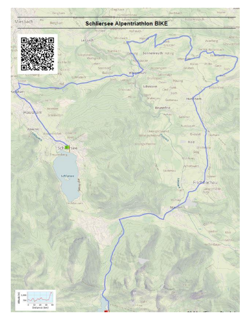
Drafting is strictly forbidden for all categories!

The vast majority of the course is closed to public traffic. Nonetheless, the traffic regulations have to be considered!